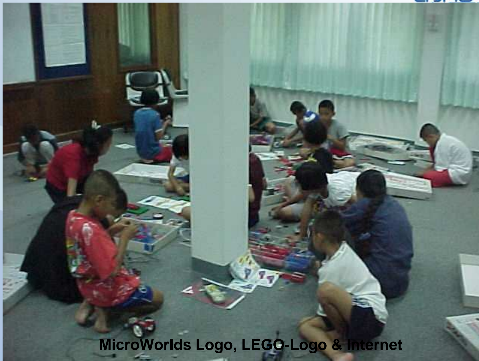
MicroWorlds Logo, LEGO-Logo & Internet